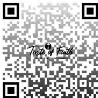
Table Host Packet

Embassy Suites by Hilton Little Rock 11301 Financial Centre Parkway Little Rock, Arkansas